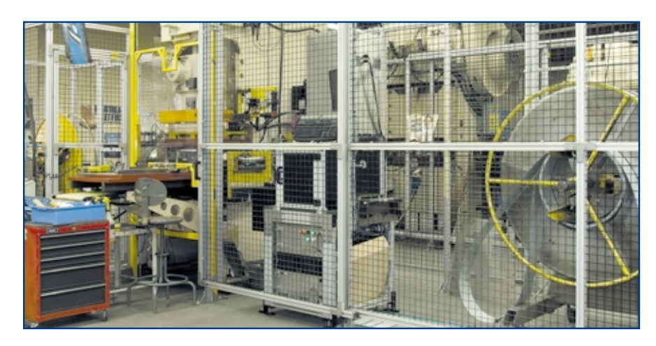
The LIM<sup>™</sup> system opens a whole realm of new possibilities compared to the regular operation of stamping press. Implementation of the LIM<sup>™</sup> system in your business is the start of your clear manufacturing advantage.

3) The LIM<sup>™</sup> system can allow metal part manufacturers to compete effectively against companies with business models strictly based on manufacturing in countries with lower wages workers, because the Return on Investment (ROI) of a LIM<sup>™</sup> system is typically less than two-years. With increasing competition from lower manpower cost in Asia and South and Central America in a global market, and increasing manpower cost in the Western World, the need for cost-effective, flexible and cleverly simple automation has never been so great.